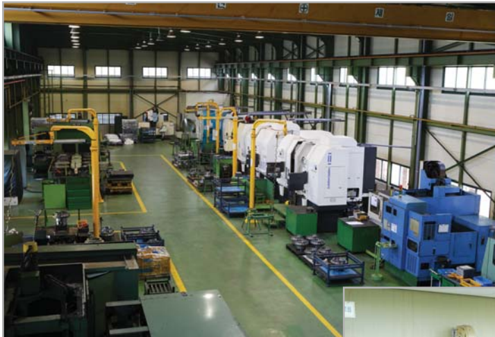
CNC MACHINE LINE