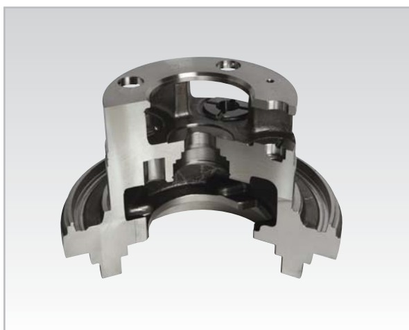
HYDRAULLIC CONSTRUCTION EQUIPMENTS COMPONENTS