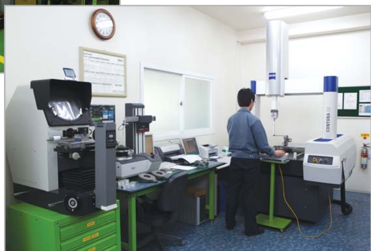
QUALITY CONTROL LAB