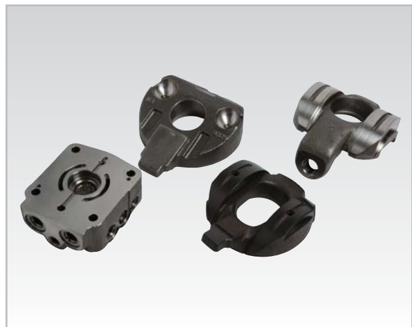
HYDRAULIC CONSTRUCTION EQUIPMENTS COMPONENTS