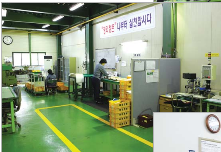
AUTOMOBILE COMPONENTS LINE