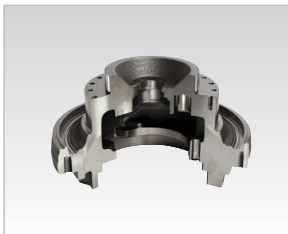
HYDRAULLIC CONSTRUCTION EQUIPMENTS COMPONENTS